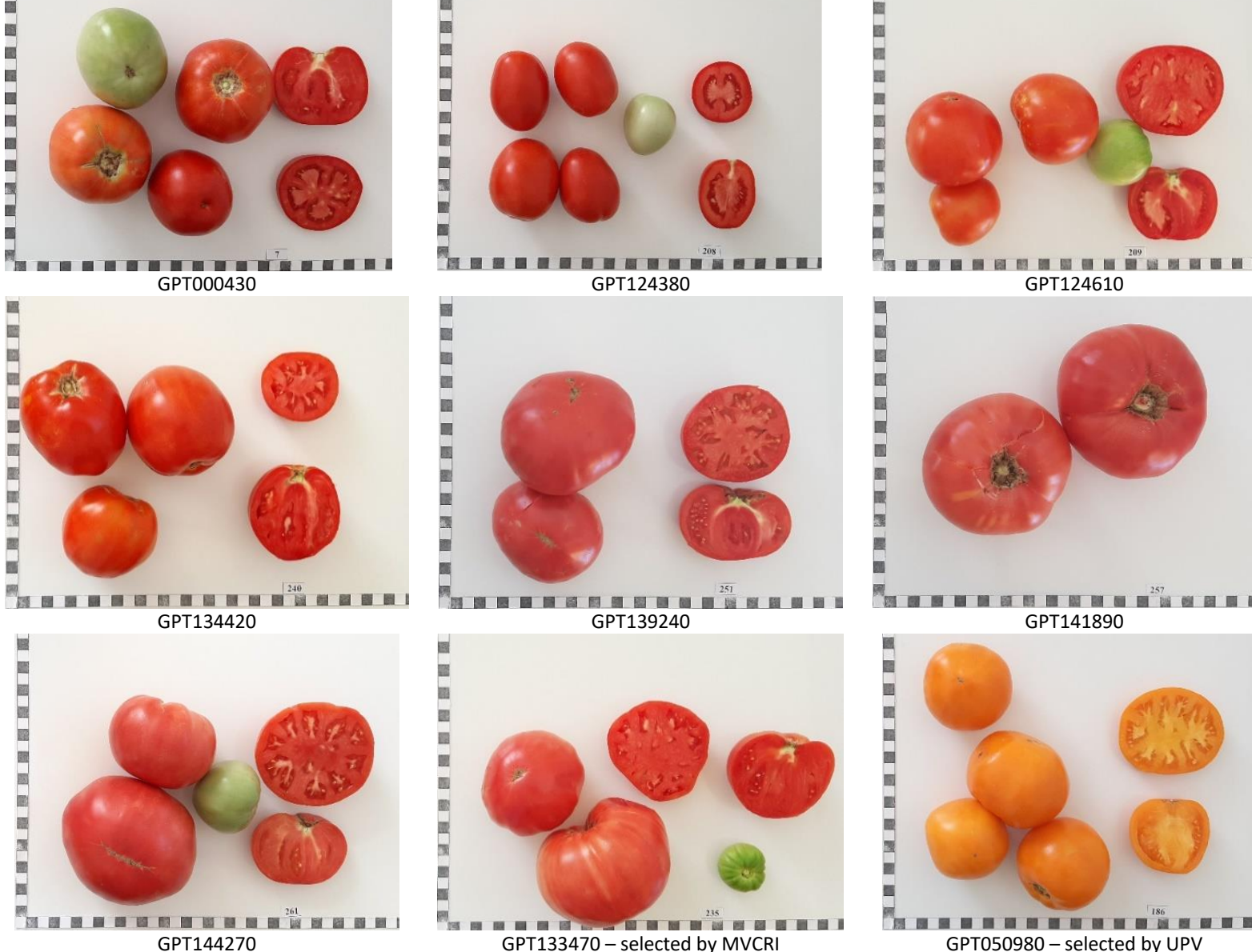
Figure 4. Variability in fruit traits in some selected landraces from the G2P-SOL project.