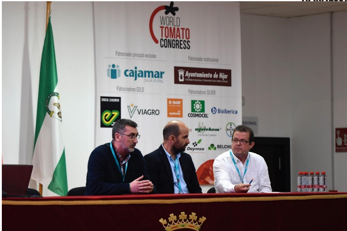
HARNESSTON coordinator participating in the round table with ENZA Zaden and BASF