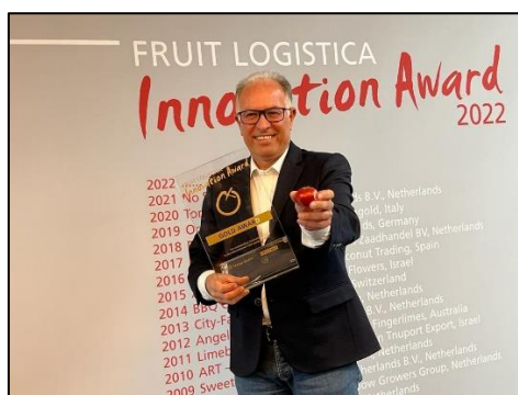
Photograph 1. The president of Granada La Palma receiving the Fruit Logisitica Award 2022.

Participation is free and necessary to receive the participation link. Please register at https://forms.gle/Gccak2LSFn5RLcsU6